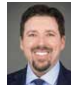
David Sarnoff, Esq.