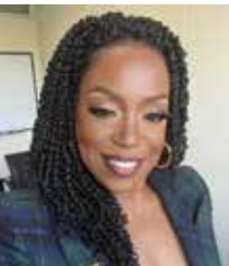
Hon. Nichelle Holmes